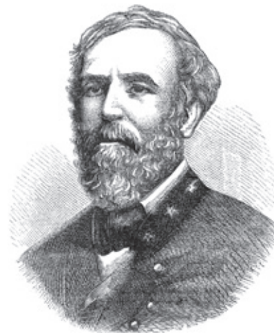
Robert E. Lee

the age of knighthood and the English country squire. America was a land that was beginning all over again, dedicated to nothing much more complicated than the rather hazy belief that all men had equal rights and should have an equal chance in the world. In such a land Lee stood for the feeling that it was somehow of advantage to human society to have a pronounced inequality in the social structure. There should be a leisure class, backed by ownership of land; in turn, society itself should be tied to the land as the chief source of wealth and influence. It would bring forth (according to this ideal) a class of men with a strong sense of obligation to the community; men who lived not to gain advantage for themselves, but to meet the solemn obligations which had been laid on them by the very fact that they were privileged. From them the country would get its leadership; to them it could look for higher values—of thought, of conduct, or personal deportment 2 —to give it strength and virtue.