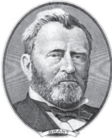
Ulysses S. Grant

5 Lee was tidewater Virginia, and in his background were family, culture, and tradition . . . the age of chivalry transplanted to a New World which was making its own legends and its own myths. He embodied 1 a way of life that had come down through